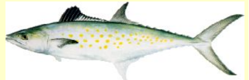
Family Scombridae, MACKERELS and TUNAS Scomberomorus maculatus