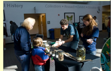
Student Chapter members at the Florida Museum of Natural History with an interpretive exhibit for children and the public. This was a great opportunity to spread awareness about the importance of the Everglades ecosystem and provide exposure for the Chapter.