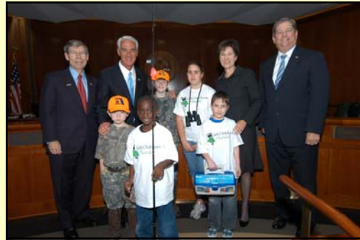
Picture from left: Attorney General Bill McCollum, Governor Charlie Crist, Chief Financial Officer Alex Sink, and Commissioner Charles Bronson with Florida children.