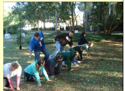
Project WILD is one of the most widely used conservation and environmental education programs used in pre-K through 12th. The Project WILD—Aquatic certification course was sponsored by TWS and was administered at UF in November. Fun and games (above) were associated with the curriculum.