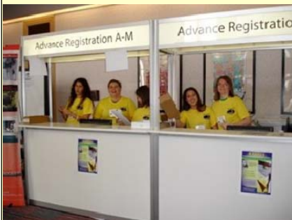
Students networked and volunteered their time at Annual Wildlife Society Conference in Miami in November, 2008, which was hosted by the Florida Chapter.