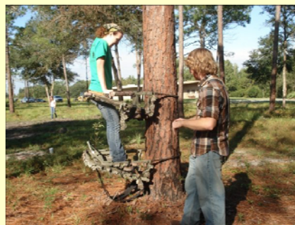
Picture from a Student Chapter trip to Caravelle Ranch where professors and biologists came out to teach wildlifer techniques. Also included was herping, birding, and spotlighting.