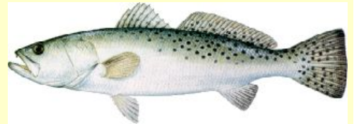
Family Sciaenidae, DRUMS Cynoscion nebulosus

Come to our next Spring Conference, and you too can help generate some stories!